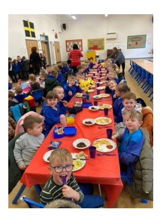
Tocyn laith winners for this week!

It was so wonderful to see such happy children this week, taking home a book that they have selected thanks to The Books Council of Wales, for such a generous donation to all of our learners. Enjoy the class photographs on our Twitter feed: